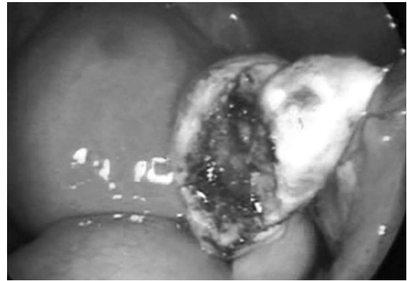
Picture 2: A view after laparoscopic excision