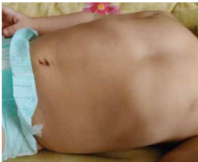
Figure 2. Postnatal photograph of the child with pectus excavatum

Surgery is offered to patients with a PSI of >3.25 (5) . Prenatal adaptation of this index is reported for the first time in our case. The PSI of our fetus (1.44) was consistent with good prognosis (PSI <3.25 ), which can be defined as deferability of surgery at least until the end of adolescence. Other tests needed for these patients are electrocardiography, echocardiography, and exercise tests in order to establish preoperative cardiopulmonary functions.