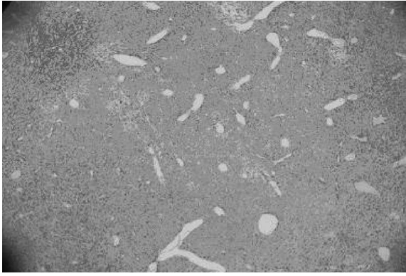
Figure 2: Hypo and hypercellular areas.