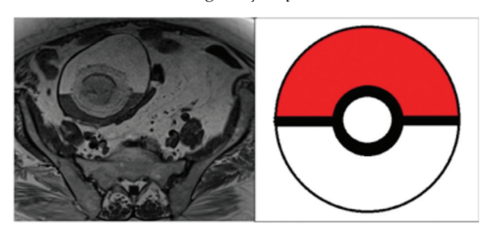
Figure 1. A 67-year-old woman with right ovarian mature cystic teratoma. A large floating ball is seen in the interphase of fat-fluid level in T1-weighted magnetic resonance imaging. It seems similar to the schematic drawing of "Pokemon ball" with different signal intensities of fluid, fat and the ball. Note that the ball has a central nidus as in the schematic drawing

Floating ball(s) were demonstrated in 30 (25.4%) MCT lesions (Figure 1 and 2). In 2 cases with the floating ball sign, MCT was associated with malignancy (squamous cell carcinoma).