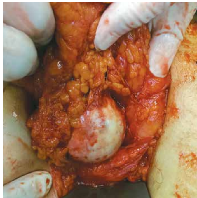
Figure 2. Parasitic dermoid cyst surrounded by the omentum in the surgical examination